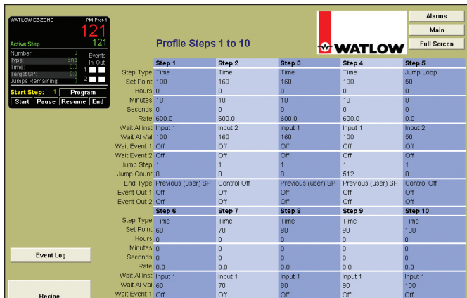
Make screens with most often used parameters. Enable recipe management to reduce operator errors when setting values.