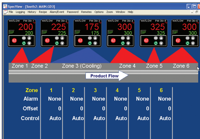
Create application-specific screens that depict process data so users can relate.